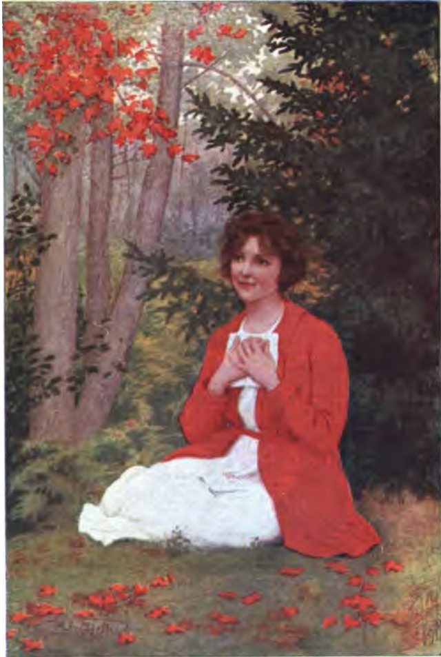
"RILLA READ HER FIRST LOVE LETTER IN HER RAINBOW VALLEY FIR-SHADOWED NOOK"