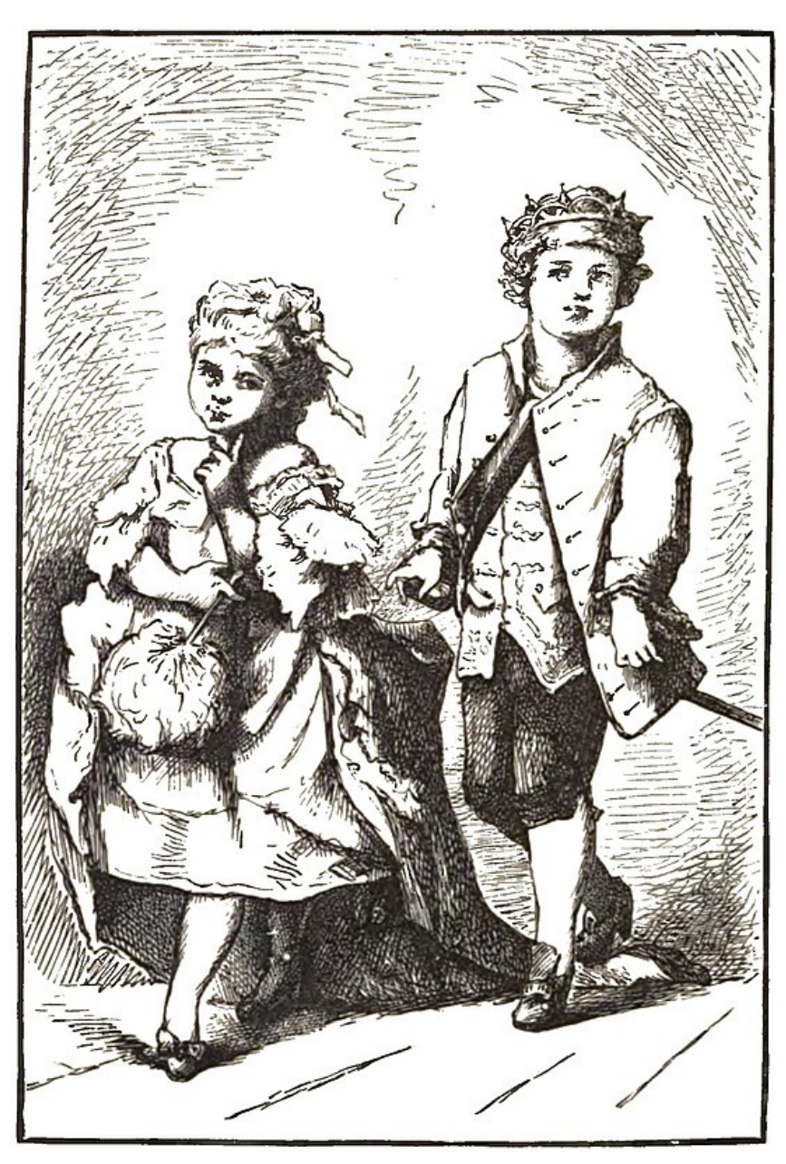
THE PRINCESS AND THE PRINCE.

"The stately jig executed by the little couple was very pretty, for the childish