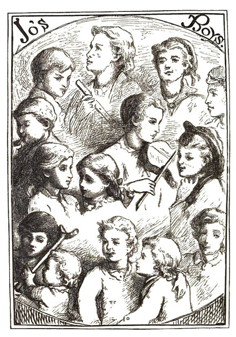
"These were the boys, and they lived together as happily as twelve lads could;