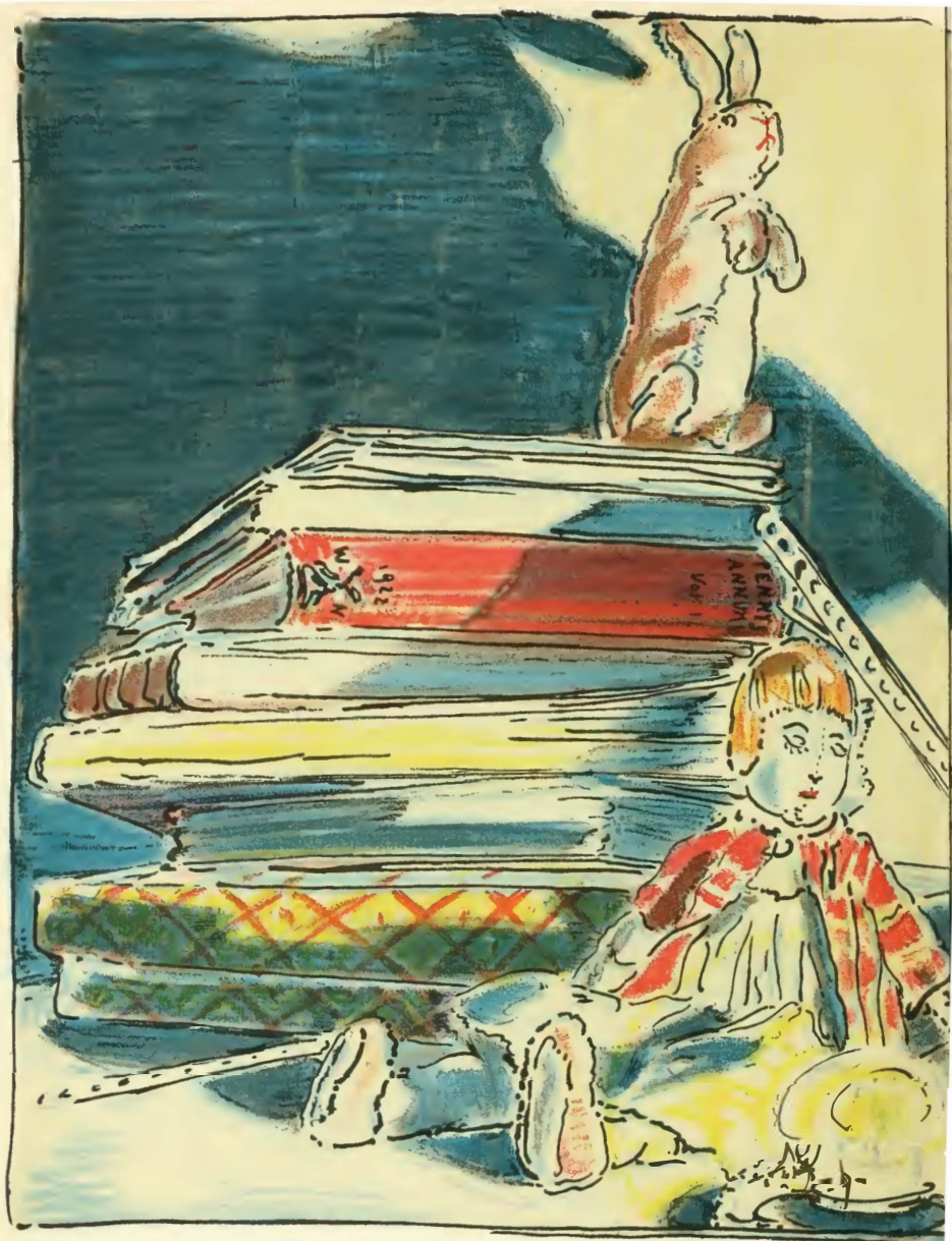
The Skin Horse