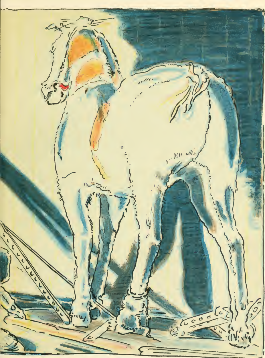
tells his story