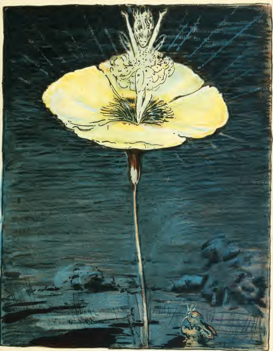
The Fairy flower