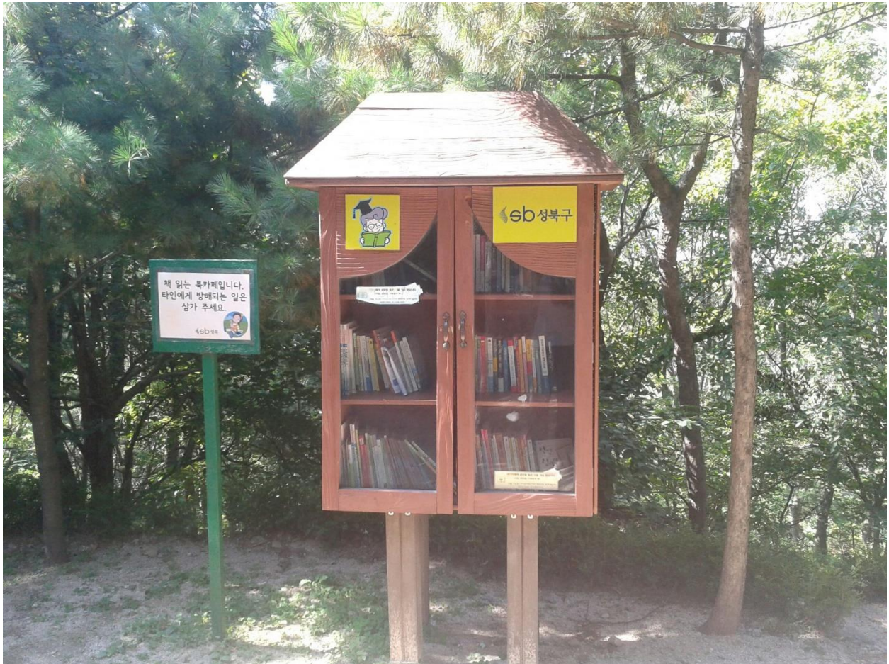
Mountaintop free library, Seoul, South Korea.

Authored by students from the Department of Information Science LIS 503: International Librarianship course University at Buffalo Summer 2019