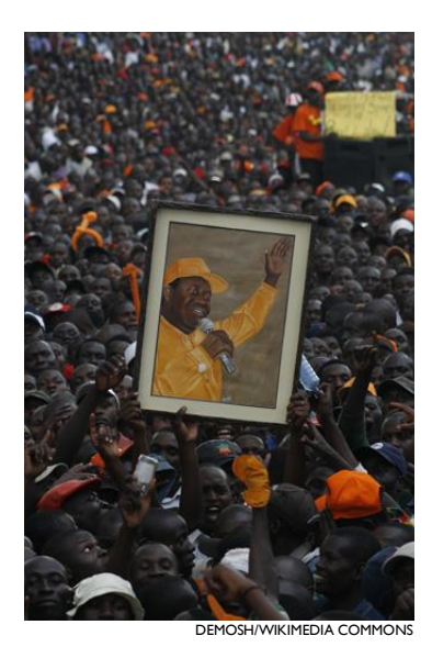
Supporters hold up a portrait of presidential candidate Raila Odinga before the 2007 Kenyan general election.

The role of implementing partners and FSNs. When considering the reporting of atrocity-related information, it is important to recall the different roles that members of the "USAID team" play. In particular, information sharing from non-USG actors is always voluntary, unless it is specifically required by their contract or cooperative agreement. If a USAID partner is going to be specifically directed to collect or share certain kinds of information, USAID's communication with the partner must follow the terms of the award and should be sensitive to the realities of the local context. Humanitarian organizations in particular may be reluctant to report on atrocity-related information if doing so could be perceived as a violation of the humanitarian principles of neutrality, impartiality, and independence. In addition, USAID personnel should remember that their FSN colleagues are citizens of the country that may be experiencing atrocities or identity-based conflict. In a highly polarized conflict situation, USAID field officers need to be sensitive to the way in which FSNs' identities and place within the society may affect their access to information and assessment of the conflict.