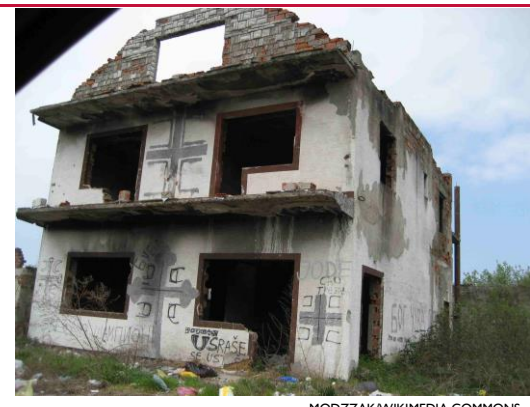
A Croatian home shows the aftermath of ethnic cleansing.

Mass atrocities are generally understood as large-scale and deliberate attacks on civilians. This definition distinguishes mass atrocities from small-scale or sporadic violence, however grotesque; from accidental civilian casualties during war; and from attacks on combatants. It is also meant to distinguish mass atrocities from the types of human rights violations that are very common around the world. Mass atrocities are—thankfully—relatively rare.