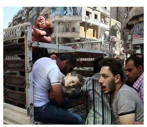
Wounded civilians arrive at a hospital in Aleppo during the Syrian civil war.

In 2011, atrocities in Syria were initially one-sided (government-perpetrated) attacks on civilian protesters, committed before there was an organized armed rebellion. As the situation evolved, some groups opposing the government took up arms and the crisis attracted armed groups from across the region. Government-perpetrated atrocities continued into the period of major armed conflict. Some anti-government armed groups have committed atrocities in this period.