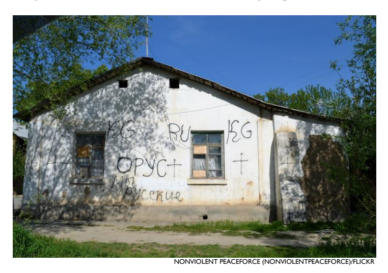
In Kyrgyzstan, people indicated their nationality — other than Uzbek — to protect their houses from looting and burning.

a rare, but not unprecedented, type of atrocities event—i.e., those committed by non-state actors outside of an armed conflict. As in Kyrgyzstan, these types of atrocities are normally at a lower scale than those that involve the state or occur during an ongoing armed conflict.