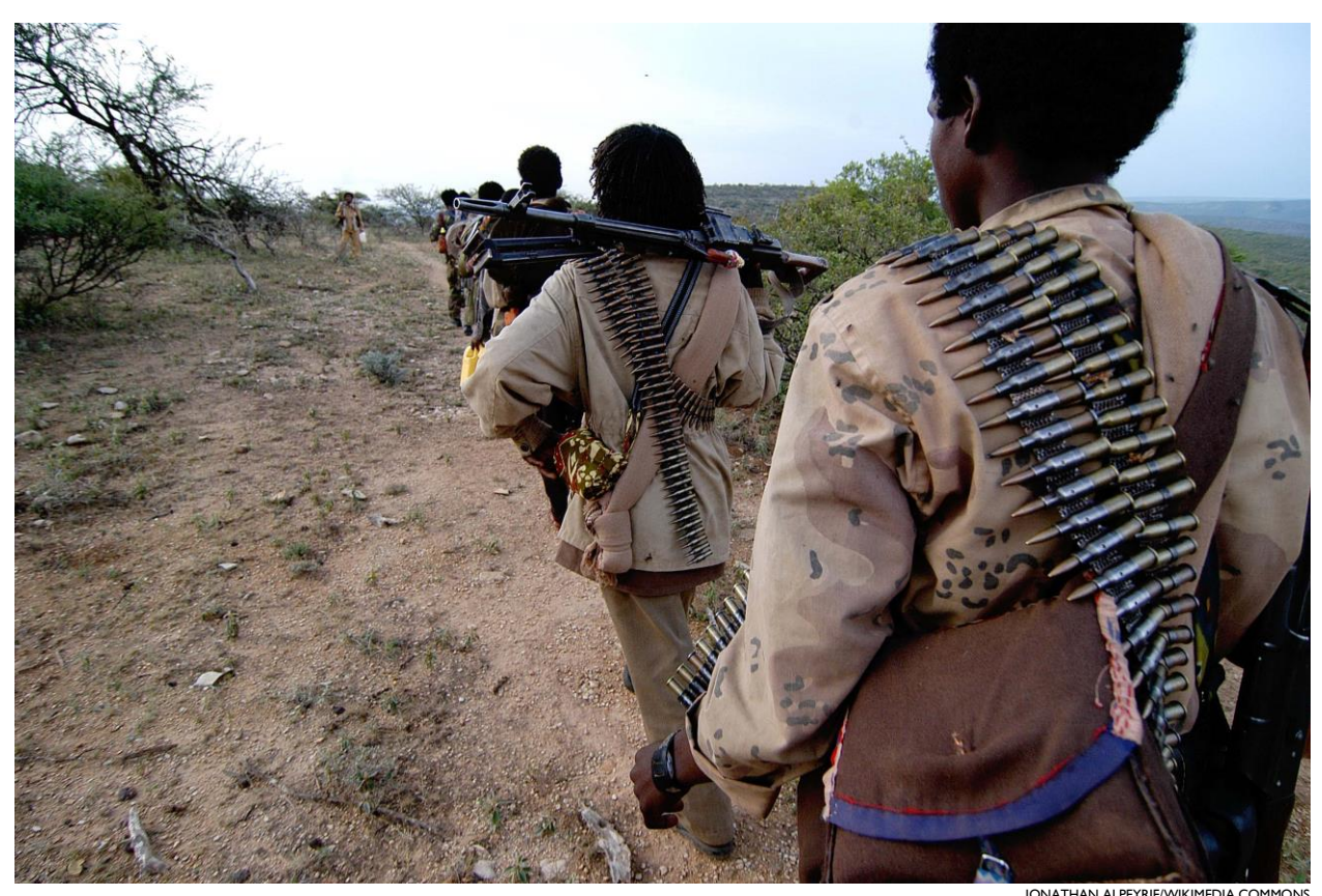
Ogaden National Liberation Front rebels in Ethiopia relocate after being surrounded for a week on a hilltop.