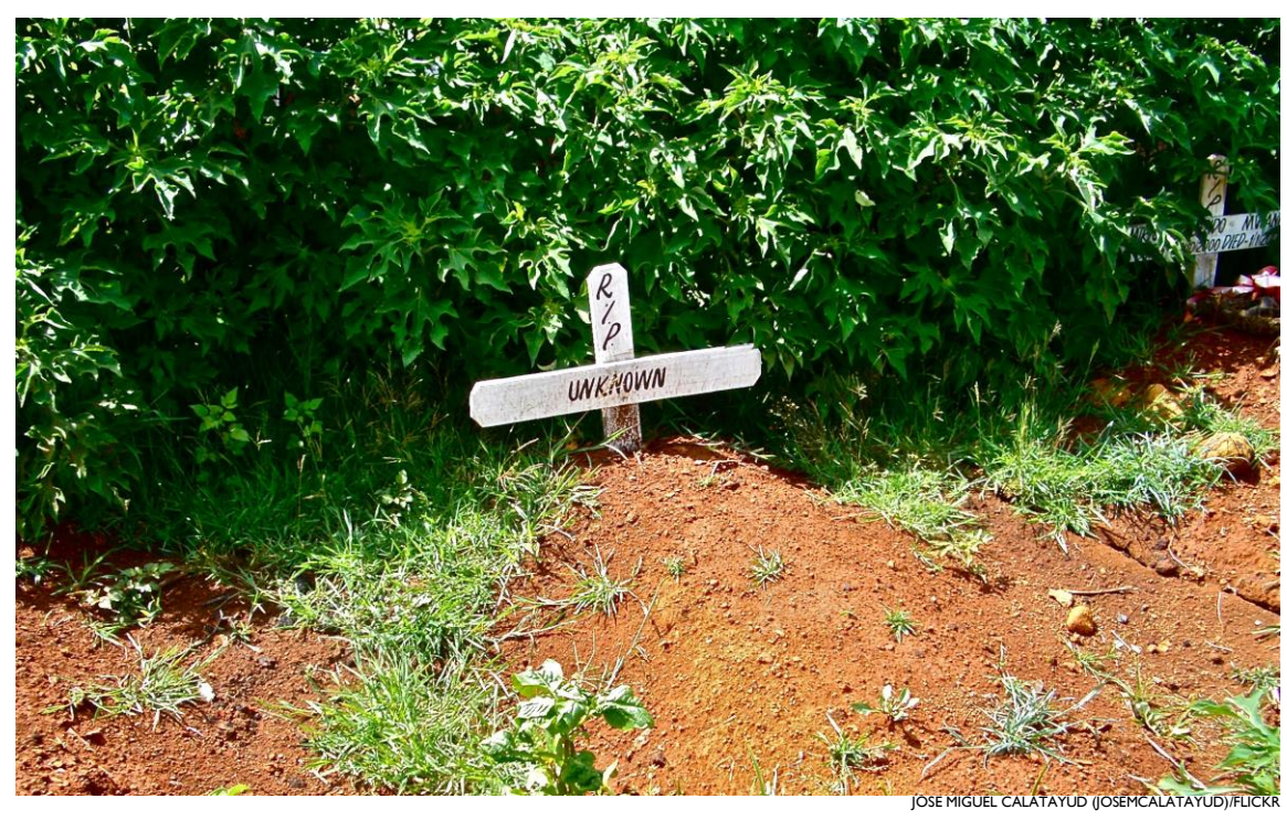
An unknown grave at the Kiambaa churchyard marks the remnants of post-election violence in Kenya.

It should be acknowledged that this division risks oversimplifying what is an overlapping, interconnected set of USAID responsibilities in complex and constantly changing environments. Countries do not proceed predictably or linearly from prevention to response to recovery phases, and the lines between these domains are inherently blurry. Nevertheless, discussing the distinctions can help elucidate USAID's role. The next four sections address each of these areas, providing guidance and options for USAID field staff.