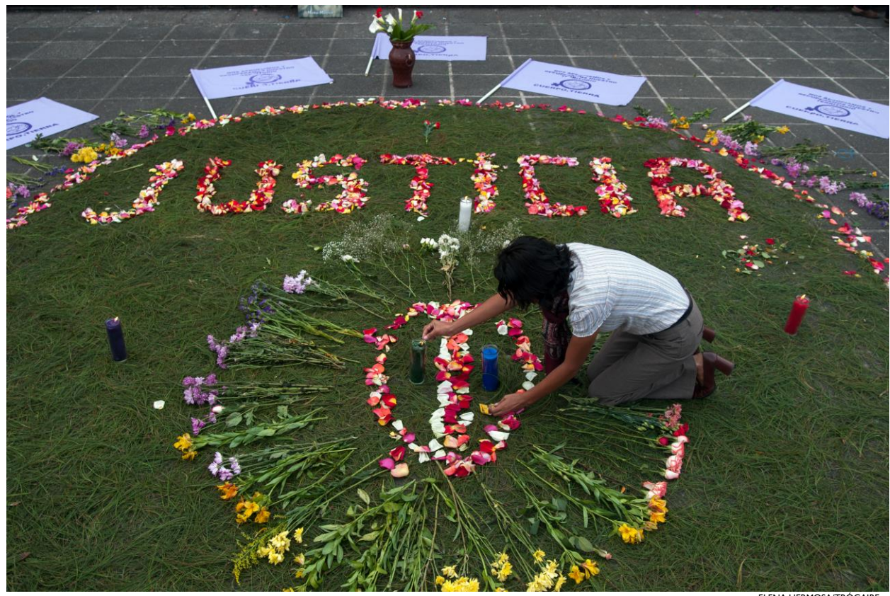
A Mayan altar sits outside the Supreme Court of Justice in Guatemala.