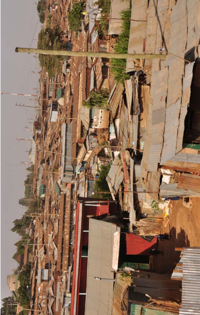
PLATE 3 An example of a slum settlement