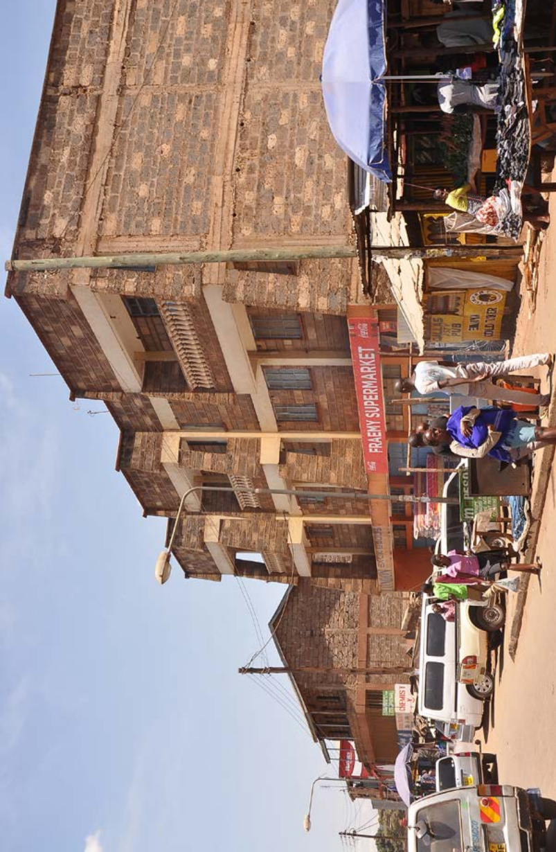
PLATE 5 Mixed trade and residential space in self-developed urban areas