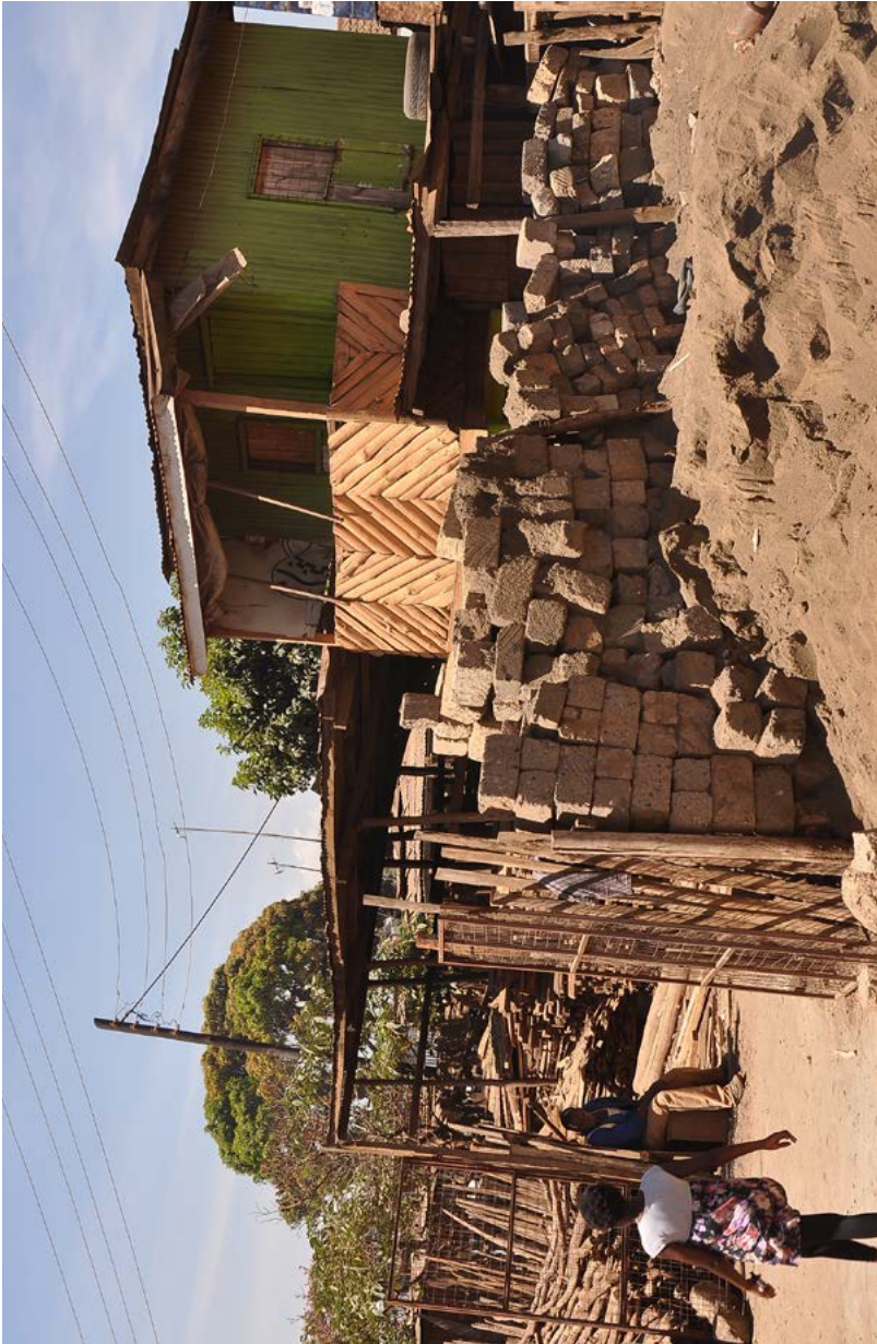
PLATE 11 A trader selling wood, sand, bricks and other building materials from his yard