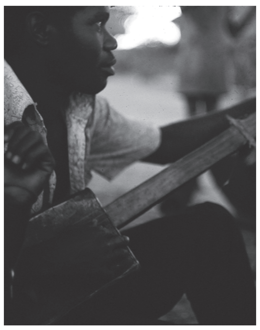
Man playing the banjo, Kaputa (northern Zambia), 1976.