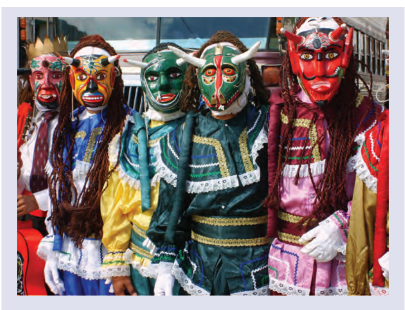
Dancers of the Rabinal Achi.

were threatened by the play's interrogation of the dynamics between rulers and their subjects and tried to censor the performance, especially Cawek's "decapitation." In 2005, the dance drama from Rabinal Achi was named one of the Masterpieces of the Oral and Intangible Heritage of Humanity by UNESCO.