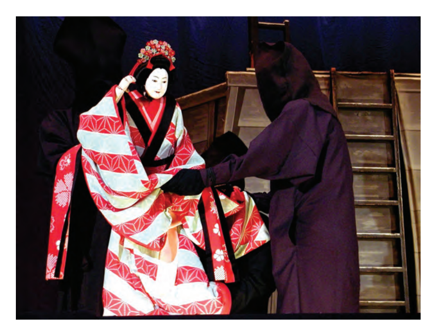
Bunraku performance in Kyoto, Japan, 2002.

that period. All puppets are operated by at least three puppeteers: one operates the feet and legs (ashizukai), another operates the left hand (hidarizukai or sashizukai), and the main puppeteer (omozukai) manipulates the right hand and head. The puppets are built with movable eves and mouths and jointed fingers, and some are designed to transform into demons. The puppeteers are dressed in black and, according to troupe conventions, may even cover their heads in a black hood. The tayu is responsible for chanting the text from a lectern, including creating different voices, pitches, and facial expressions for all characters. Next to the tayu, the musician plays the shamisen, a Japanese banjolike instrument. Bunraku puppeteers must first learn manipulation of the feet and legs, then the left hand, and finally the right hand and head. This process can take thirty years to master. Bunraku puppets are usually three to four feet in height, with human and yak hair and ornate costumes. Double-suicide love stories are common in bunraku , many of which were penned by "Japan's Shakespeare," Chikamatsu Monzaemon. Traditional bunraku is carried on today by two male-dominated institutions in Japan, employing the rare woman as a builder rather than a performer.