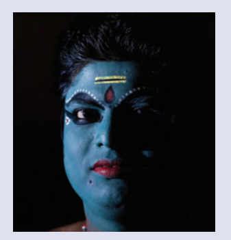
Another kathakali performer waits to enter the stage.