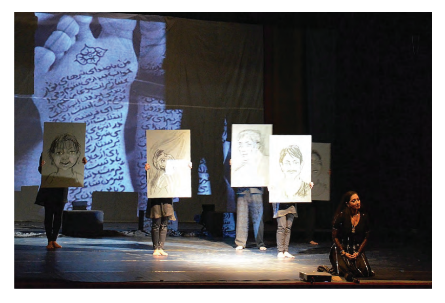
2012 Tehrik-e-Niswan's production of We are the Dispossessed . Moving between past and present, this multimedia production shows how war affects women through violence, loss, rape, and displacement.

Pakistan . In Pakistan, the Tehrik-e-Niswan (Women's Movement) theatre and performance troupe have been advocating for women's rights since they formed in 1979. Through their plays and dance performances, the women actors continue to communicate their feminist message.