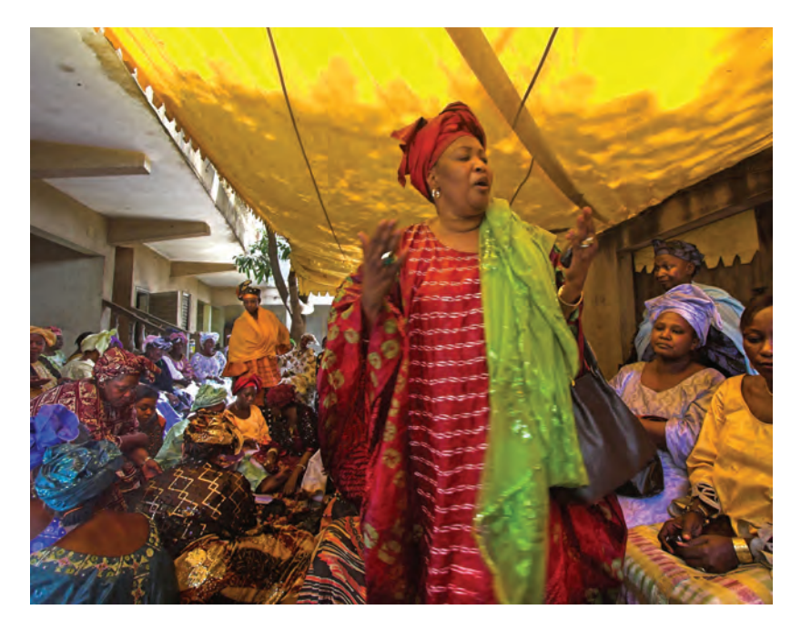
A griot sings at an engagement party in Mali, 2006.