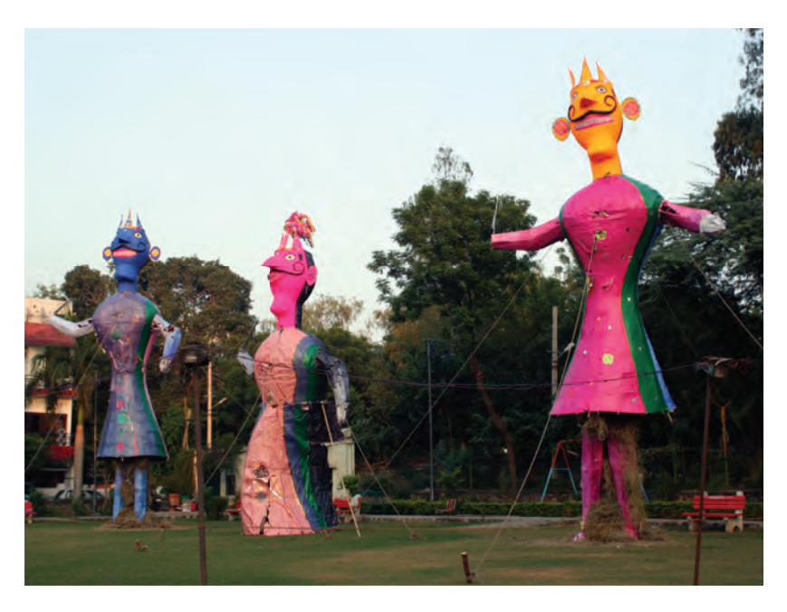
On the last day of Ramlila, these giant effigies of the demon king Ravana and his brother and son will be set on fire. Performed in New Delhi, India, 2012.

film industry, Bollywood exports Indian culture globally and meets the demands of Indian audiences who evaluate Bollywood actors by praising a successful actor as paisa vasool —translated literally as "worth the money" spent on the movie admission. Bollywood draws on many traditional Indian performance forms for inspiration, largely aiming to appeal to a broad-base family audience with melodramatic musical films that feature dance, music, and often romance. Bollywood actors have attained international celebrity, and the conventions continue to evolve with the pressure to assimilate Hollywood film practices. The highest-grossing Bollywood film to date (at more than $60 million worldwide and $6.5 million in North America) is 3 Idiots , a comedy about three engineering students released in 2009 by Vinod Chopra Productions.