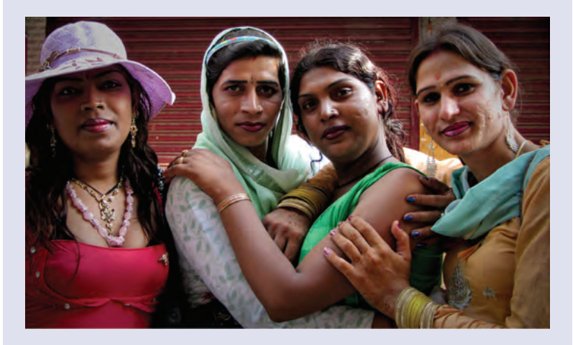
A group of Indian hijra.

The hijra of India are a community of transgendered women (many have male physiology, but identify as women) lobbying for official recognition as a "third gender" on passport documents. The