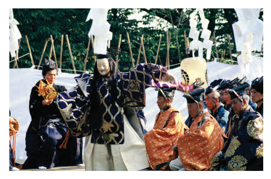
A noh performance in 2004.

elegance, and was strongly influenced by Japan's embrace of restrained Buddhist philosophy. While never enjoying mass popularity, it remains Japan's oldest theatre form and has survived with most traditional elements intact, including the exclusion of female performers.