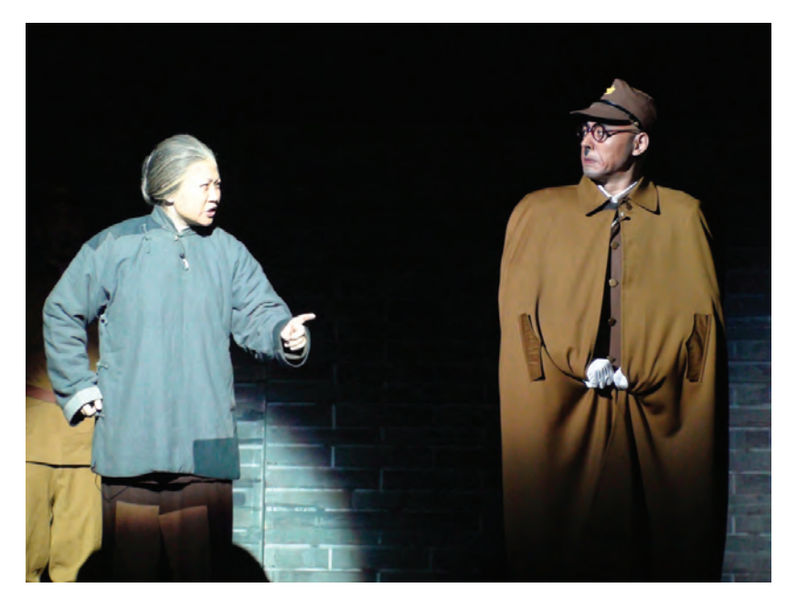
A performance of Legend of the Red Lantern at Chang'An Theatre, Beijing, 2009. It tells the story of communist resistance during the Japanese occupation in World War II.

Beijing opera, however, remains the most recognizable Chinese theatre form, having survived mandates to conform to communist doctrine in 1949 and the oppression of the Cultural Revolution after 1966. China's Cultural Revolution (1966–1976) limited permissible theatre to eight "model" plays promoting the communist government's agenda. The eight model works favored socialist realism and consisted of two ballets, a symphony, and five "revolutionary operas." The Cultural Revolution was cruel to theatre practitioners, subjecting actors and directors (as well as intellectuals, doctors, teachers) to violence, imprisonment, and forced "reeducation" via hard labor in the countryside. In the post–Cultural Revolution era, Chinese theatre flourished with a restoration of traditional plays and a fusion of traditional and modern forms. New plays were self-aware and presentational, combining spoken drama and traditional Chinese performance aesthetics. However, the mid-1980s witnessed a swinging of the pendulum as these modern plays suffered a backlash and