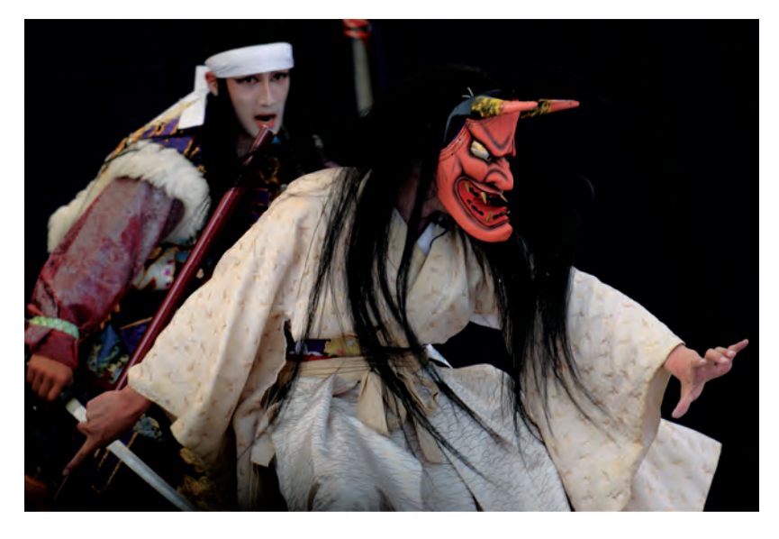
A kagura at a sacred shrine.

Kagura consists of slow, circular, and elegant choreography that emphasizes the four directions and uses handheld fans and bells.