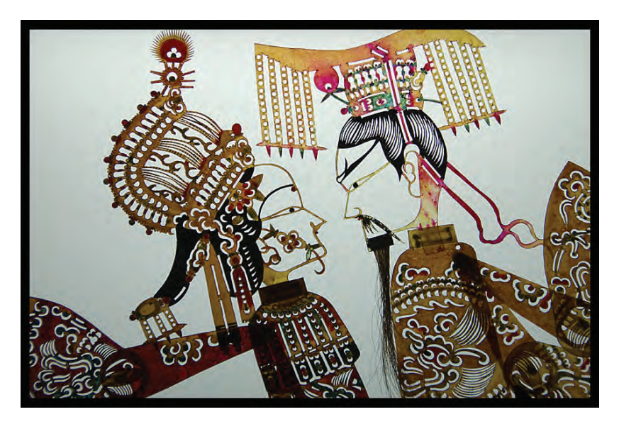
Chinese shadow puppets.

Emperor Xuan Zong of the Tang Dynasty (618–907) created the Pear Garden school for entertainers in 714, with a mission to innovate art forms and create a distinctively Chinese theatre. The Pear Garden served more than eleven thousand students who studied music, dance, acrobatics, and dramatic text. During the Song Dynasty (960–1279),