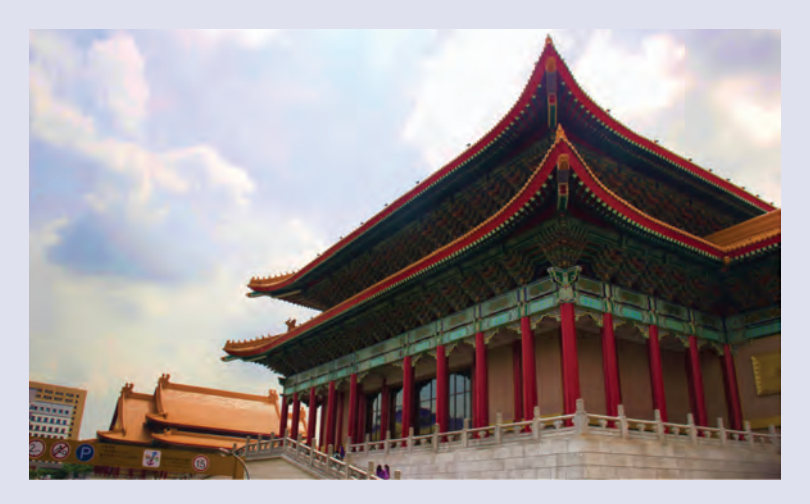
Zhongzheng District, Taipei, Taiwan.

The National Theater Concert Hall (NTCH) in Taipei City was built in 1987 to host Chinese and international performance and serve as an experimental theatre venue. Recent productions include an adaptation of Peach Blossom Fan , by Qing Dynasty playwright Kong Shangren and performed by V_2 Q Theatre, a postmodern Chinese theatre company established in 2006 that blends traditional Chinese opera with experimental modern drama. NTCH played host to another contemporary Taiwanese theatre company, Mobius Strip Theatre (founded in 2005), with a recent production of Spider in Meditation , a poetic rumination on modern city life. Mobius Strip Theatre is known for their provocative audience engagement and site-specific environmental performance.