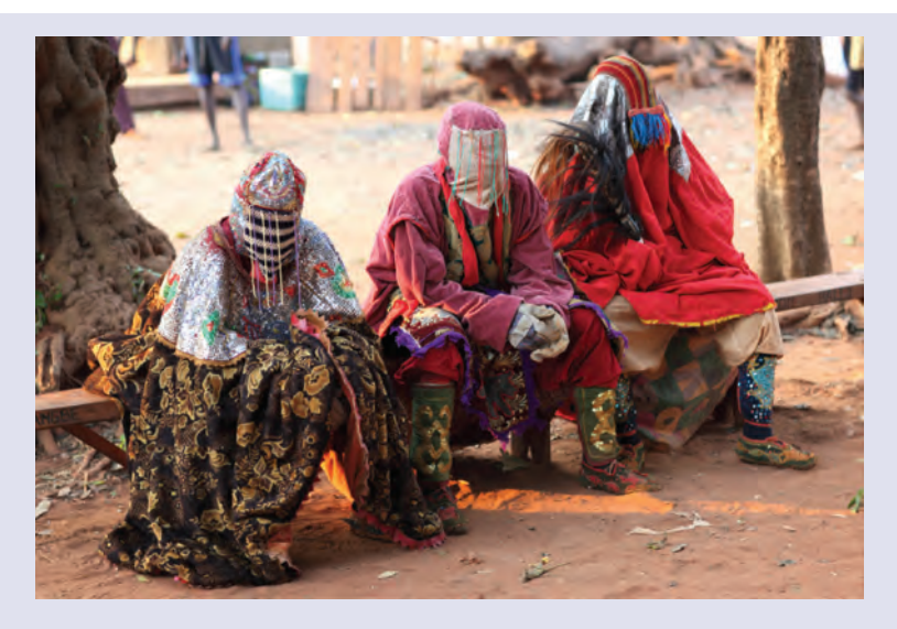
Egunguns waiting to begin, Cové, Benin, 2009.

that honors one's blood relatives is named Baba (Father) and Iya (Mother), while the rest of egungun performances honor Yoruban ancestry, traditions, and heritage more generally.