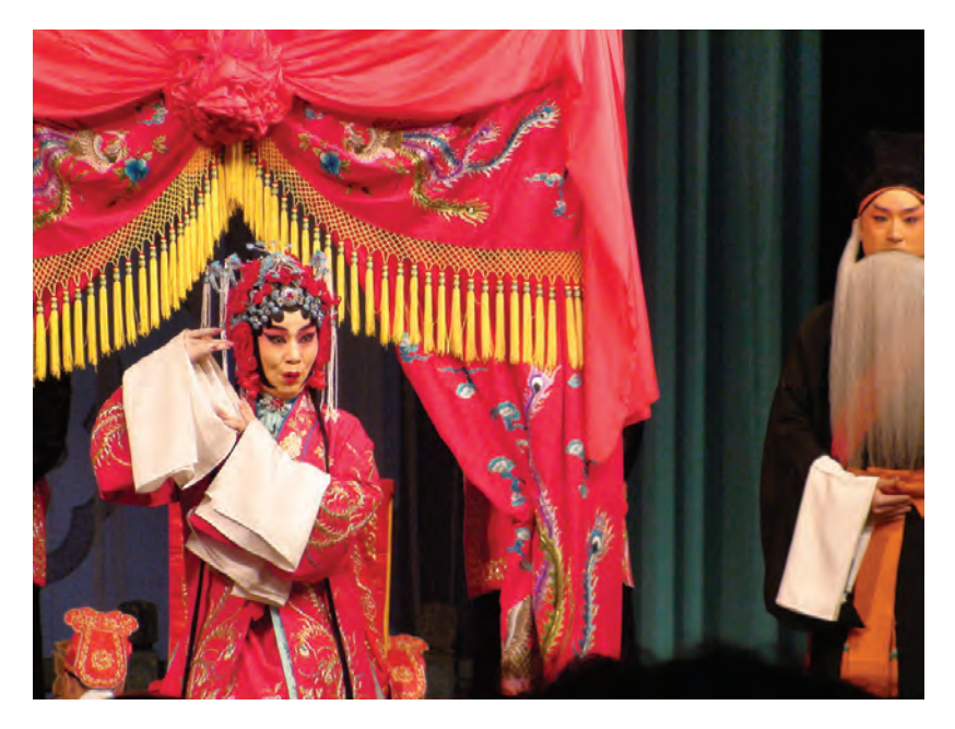
A Chinese opera performance at Chang'An Theatre, Beijing, 2009.

text while performing a story, and as long as the tale retains its happy ending, unique interpretations of major works are expected. All movement is dance in Beijing opera, as it is in sync with the orchestra and systemized: for example, similar to the Indian mudra , there are specific finger patterns to indicate numerous plot developments or emotions (such as sword battle or femininity), and the flick of a sleeve may denote disgust, or surprise when paired with a hand thrown above the head. There are four types of characters: male ( sheng ), female ( dan ), painted face ( jing ), and comic ( chou ). The actors are dressed in rich, colorful costumes and, as with Indian kathakali and Japanese Kabuki, distinct makeup. The painted-face characters have codified patterns and designs on the face that amplify the archetypal characteristics of the general, dragon, or hero, to name a few.