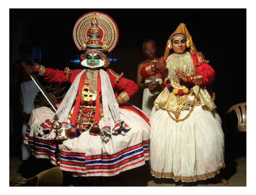
A kathakali performance in Fort Cochin, Kerala, India.

Kathakali performance of Kerala is closely related to kutiyattam and dramatizes devotion to the Hindu god Vishnu. Traditionally, kathakali dancers are all male and perform the physically demanding, martial arts–inspired choreography after many years of rigorous training that includes strenuous exercises for strength and flexibility and body massage. Specific characters are immediately recognizable to the audience because of the consistent makeup and costume codes for each role. In