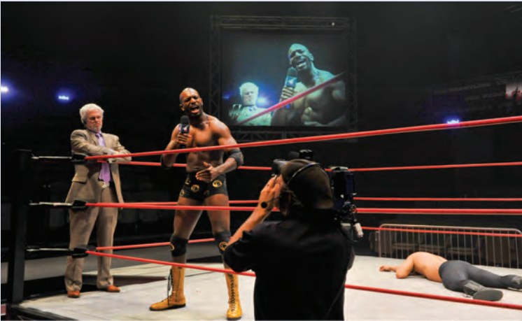
A scene from Dallas Theatre Center's 2012 production of The Elaborate Entrance of Chad Diety.

Anthropologist Claude Lévi-Straus would describe sports as having a “disjunctive effect.” In other words, unlike ritual, which brings groups together, sports divides individuals or groups into winners and losers where there was originally some kind of equality.