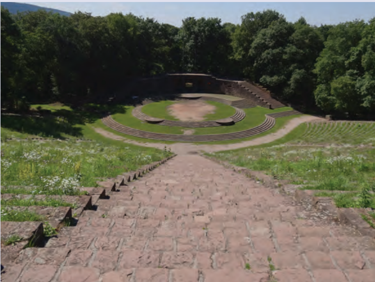
A thingplatz near Heidelberg, Germany.

Sometimes theatre has been used for abhorrent propaganda. Before World War II, the Nazi regime held elaborate outdoor pageants called thingspiele (“meeting or judgment plays”) in specially built theatres called thingplätze such as this one near Heidelberg. With thousands of performers collected into huge choruses, these plays tried to conjure up a mythological German past in order to celebrate German fascism and Nordic supremacy. After a short period of success, the public lost interest in these spectacles and the program was scrapped. Of the two hundred theatres planned for construction, approximately forty-five were built. Today, the few theatres that survive are used for rock concerts and other events.