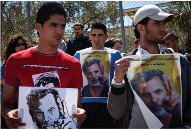
Palestinians demonstrating in Ramallah on April 4, 2012, the one-year anniversary of the murder of Juliano Mer-Khamis. Despite their urgings, the Palestinian police have not found his killer.

community. Most simply put, it is a creative representation that is produced out of intimate engagement with a community.