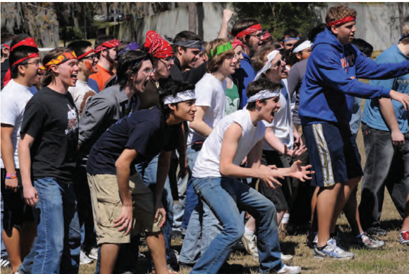
On hundreds of college campuses, a large-scale game of tag is played called Humans vs. Zombies. The backstory is that a zombie infection has taken root and humans must fight for their survival. Human players must kill zombie players with toy guns, but if a zombie touches ("infects") them, humans must change sides. Zombies "die" if they do not feed in forty-eight hours. This photo is from a 2010 game at the University of Florida.