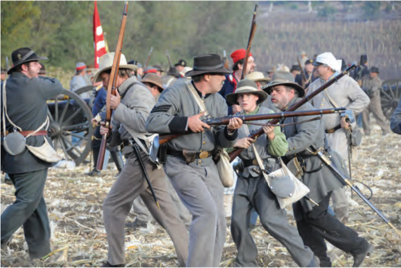
Like the ancient Abydos participants, we continue to duplicate important cultural events. This photo shows a 2008 Civil War reenactment in Moorpark, California.