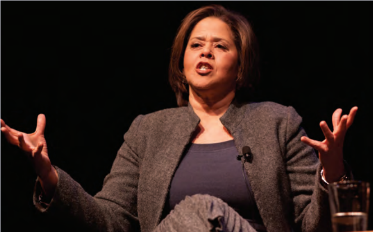
Anna Deavere Smith.

The Laramie Project (2000) was devised by members of the Tectonic Theater Project. They sought to understand the rural community of Laramie, Wyoming, where Matthew Shepard, a gay twenty-one-year-old university student, was savagely assaulted and left to die by two local men. They spent fifteen months in the city conduct-