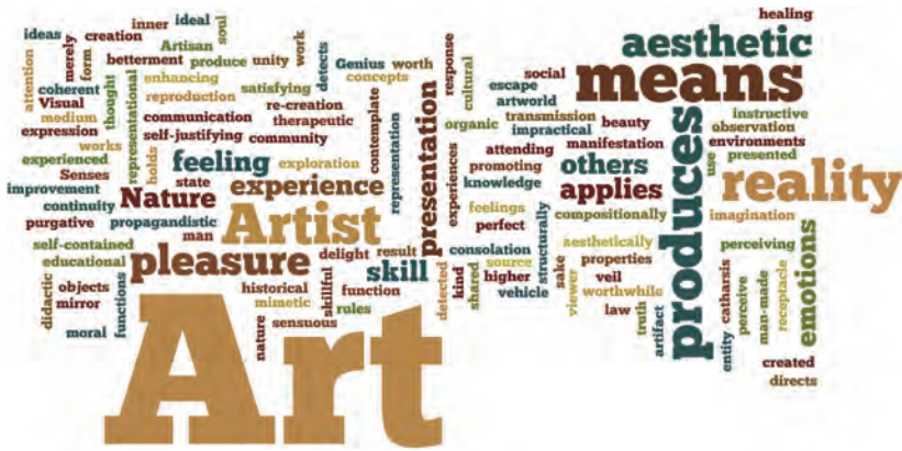
This is a word cloud, a type of data visualization where more frequently used words become larger than others. It was created by comparing two dozen definitions of art from classical to modern sources.

spontaneous overflow of powerful feelings” from “emotion recollected in tranquility.” Novelist Leo Tolstoy wrote that experiencing art was “receiving an expression of feeling” from the artist.