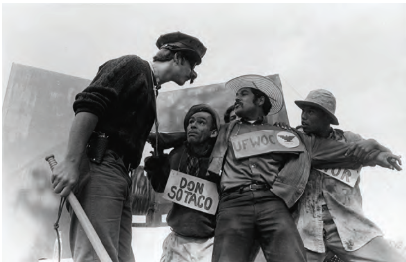
A performance by El Teatro Campesino, 1966.