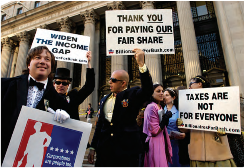
A 2007 Billionaires for Bush performance in New York City.

Whose president? Our president! Whose money? Our money! Whose media? Our media!