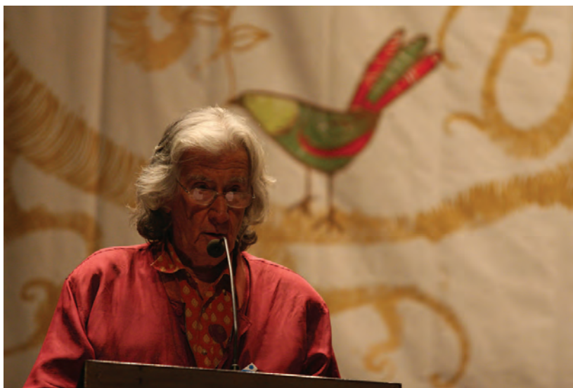
Augusto Boal in 2007.

Augusto Boal (1931–2009) was a Brazilian theatre director and founder of Theatre of the Oppressed. His early career was spent directing at Arena Theatre of São Paulo, where he laid the groundwork for the theatre's nationalist productions and directed classical work with an eye to making it relevant to Brazilians. In 1971, Boal was kidnapped, arrested, tortured, and exiled because of his cultural activism, which was perceived as a threat to the Brazilian military regime. During his exile, he wrote Theatre of the Oppressed (1973). In this book, Boal argues for the direct participation of the audience in theatre, rather than their traditional role as passive spectators, recasting the audience as “spect-actors.” Upon his