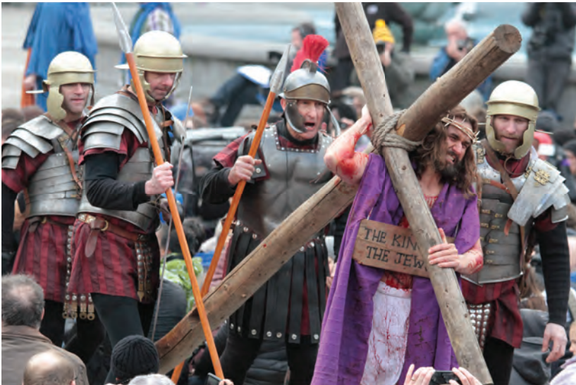
A 2013 passion play presented on Good Friday in Trafalgar Square, London.

During the medieval period, the Bible was available only in Latin and could not be understood by an illiterate public. To address this problem, the Catholic church used theatre to illustrate stories such as the Creation, Cain and Abel, and the Last Supper. Performed by amateur actors from the community, these plays were funded outside the church and often had elaborate sets and special effects. This print recreates one type of performance called a passion play , which depicted the suffering, death, and resurrection of Christ. It was presented in Valenciennes, France, in 1547; took twenty-five days to perform; and had one hundred roles for seventy-two actors. On the left, you can see a depiction of paradise with God on his throne surrounded by angels and saints. On the right, Satan and his devils control the entrance to hell or "hell-mouth." Fire and smoke effects were designed to strike fear into the hearts of any audience members that dared to sin.