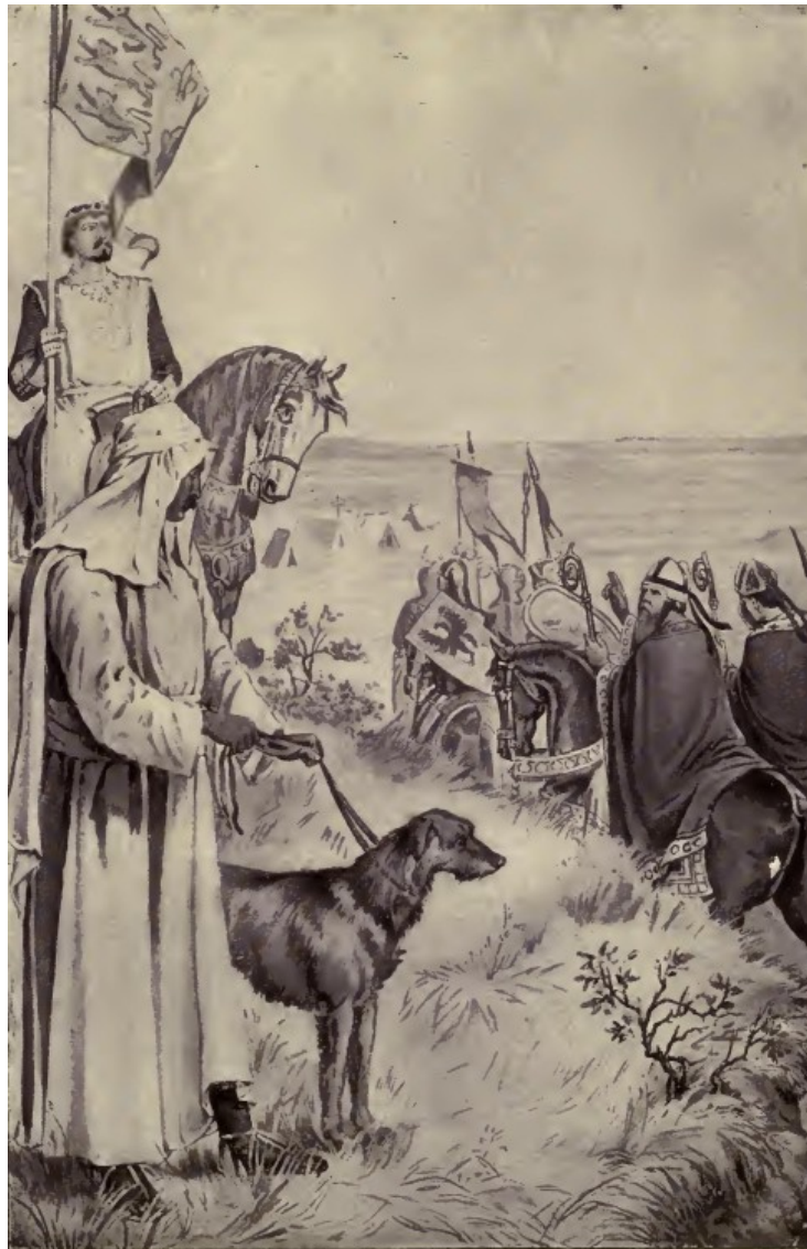
TAL. Page 355. "By his side stood the seeming Ethiopian slave."