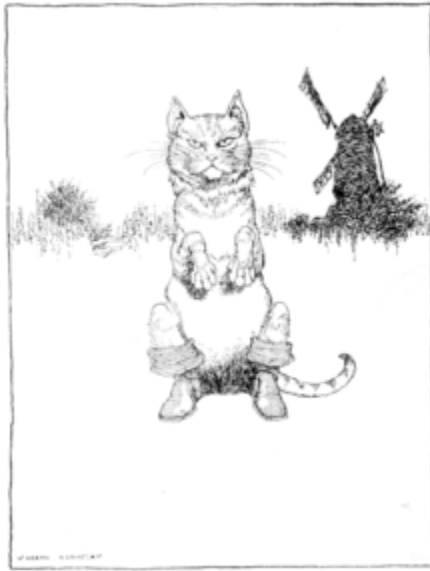
'Puss in Boots'

In due course the king asked the mowers to whom the field on which they were at work belonged.