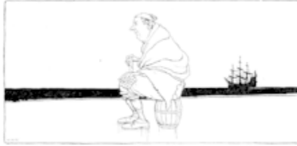
'A kindly old man'

astonished when he heard the barking of Frillikin, for no dogs ever came that way; and supposing that some travellers