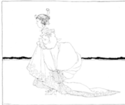
'She was an ugly little fright'

The nurse had taken great pains over the toilette of her daughter. She had decked her out in Rosette's most beautiful gown, and placed her diamonds on her head. But nothing could disguise the fact that she was an ugly little fright. Her hair was black and greasy, she was crosseyed and bow-legged, and in the middle of her back she