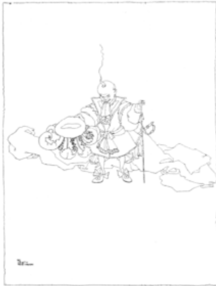
'Ricky of the Tuft'

'It will happen of itself,' replied Ricky of the Tuft, 'if you love me well enough to wish that it be so. To remove your doubts, madam, let me tell you that the same fairy