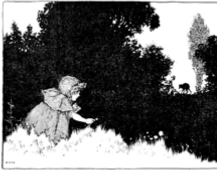
'Making nosegays of the wild flowers'

The worthy grandmother was in bed, not being very well, and cried out to him: