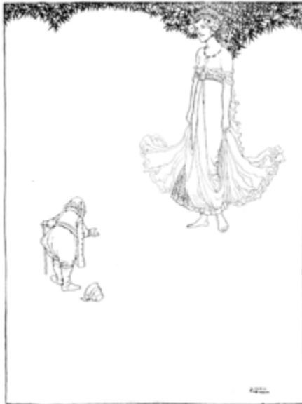
'A little dwarf who had a pair of seven-league boots'

She touched with her wand everybody (except the king and queen) who was in the castle governesses, maids of honour, ladies-in-waiting, gentlemen, officers, stewards,