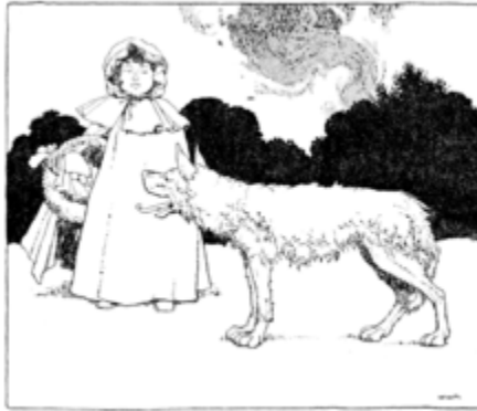
'She met old Father Wolf'

road. As she went she amused herself by gathering nuts, running after the butterflies, and making nosegays of the wild flowers which she found.