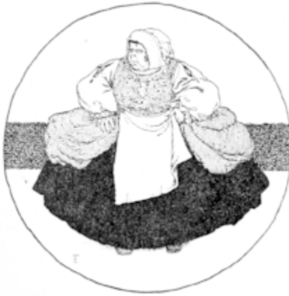
'The wicked nurse'

Very near, very near,' said the boatman.