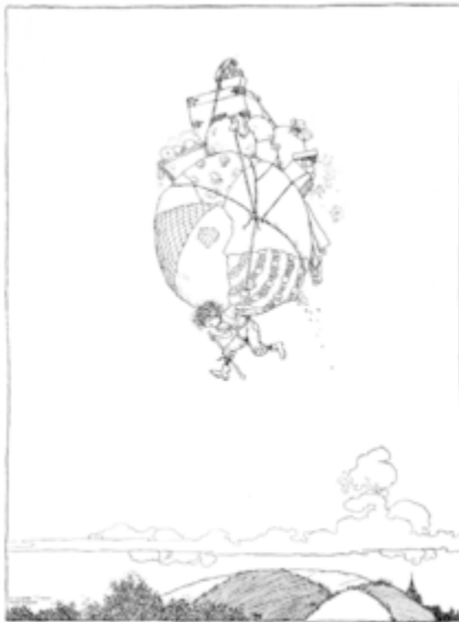
'Laden with all the ogre's wealth'

'Your husband,' said little Tom Thumb, 'is in great danger, for he has been captured by a gang of thieves, and