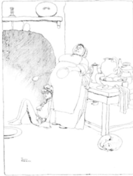
'They all fell asleep'

talking they had not succeeded in uttering one half of the things they had to say to each other.