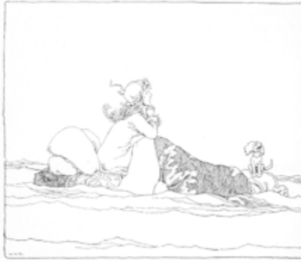
'She floated hither and thither'

For two days she floated hither and thither over the sea, soaked to the skin, nigh dead with cold, and so nearly