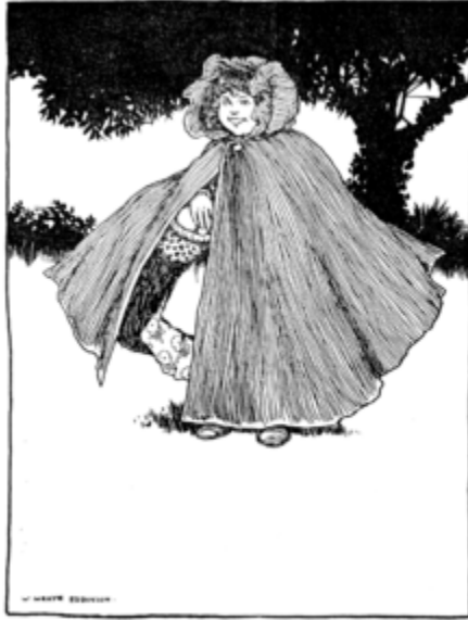
'Little Red Riding Hood'

'Oh yes,' replied Little Red Riding Hood; 'it is yonder by the mill which you can see right below there, and it is the first house in the village.'