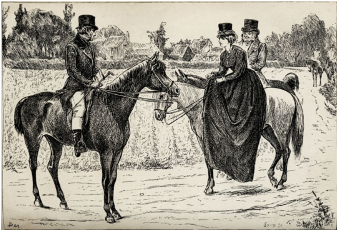
LADY HARRIET ASKS ONE OR TWO QUESTIONS.

While they were talking over this bit of land, Lady Harriet came to her resolution. As soon as her father had finished, she said,—"Mr. Preston, perhaps you will allow me to ask you one or two questions to relieve my mind, for I am in some little perplexity at present."