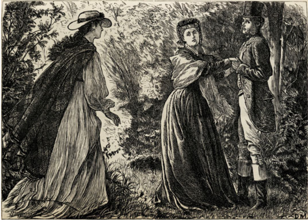
THERE STOOD MR. PRESTON AND CYNTHIA.