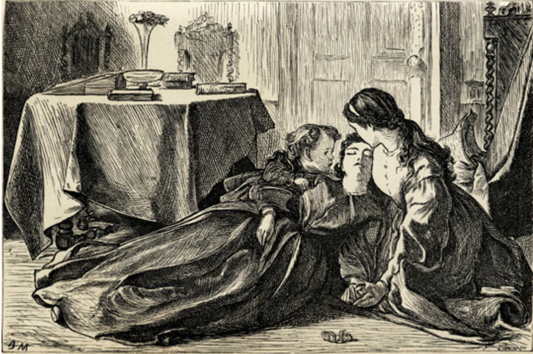
"MAMAN, MAMAN!" Click to ENLARGE

"Poor thing, poor thing!" said the Squire, bending over her, and crying afresh over her suffering. "She is but young, Molly, and she must ha' loved him dearly."