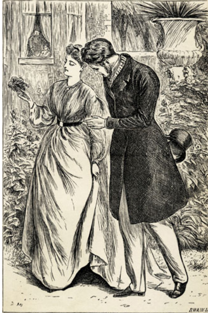
CYNTHIA'S LAST LOVER.