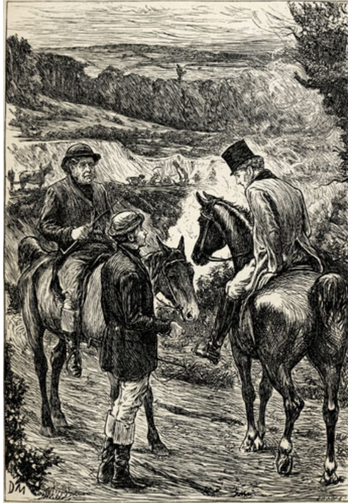
THE BURNING OF THE GORSE.