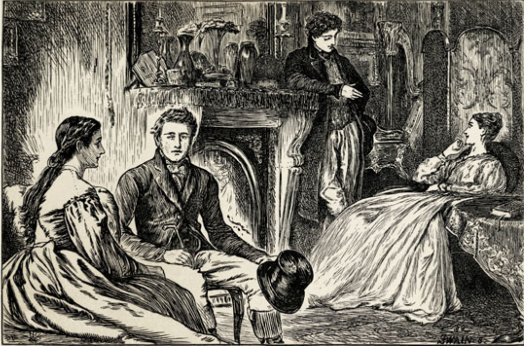
SHAKSPEARE AND THE MUSICAL GLASSES.