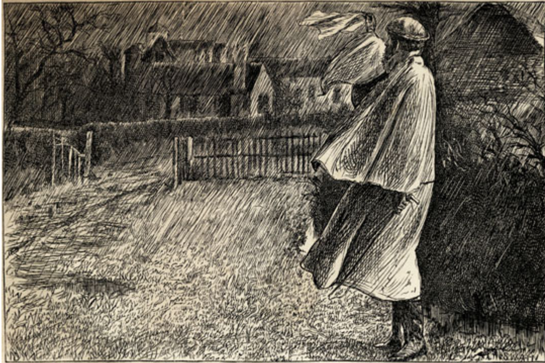
THE LAST TURNING. Click to ENLARGE

She shut the window softly, and shivered all over. She left the attic and went to her own room; but she did not begin to take off her out-of-door things till she heard Cynthia's foot on the stairs. Then she hastily went to the toilet-table, and began to untie her bonnet-strings; but they were in a knot, and took time to undo. Cynthia's step stopped at Molly's door; she opened it a little and said,—“May I come in, Molly?”