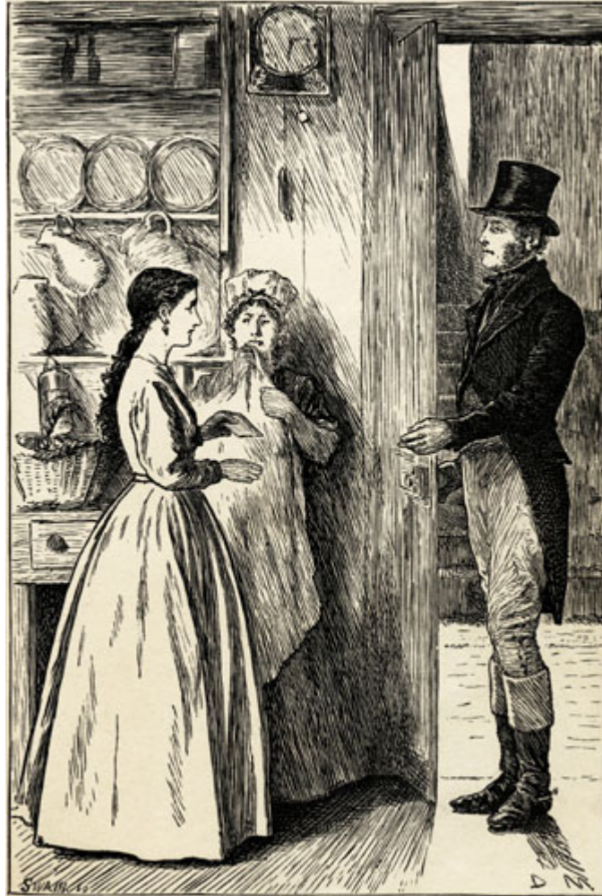
A LOVE LETTER. Click to ENLARGE

"Papa, I shall make you tell me who my correspondent is."