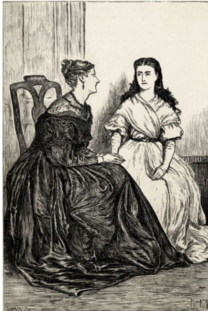
THE NEW MAMMA. Click to ENLARGE

there; but he had been detained, and she had to face Mrs. Kirkpatrick by herself, the recollection of her last day of misery at the Towers fresh in her mind as if it had been yesterday. Mrs. Kirkpatrick was as caressing as could be. She held Molly's hand in hers, as they sate together in the library, after the first salutations were over. She kept stroking it from time to time, and purring out inarticulate sounds of loving satisfaction, as she gazed in the blushing face.